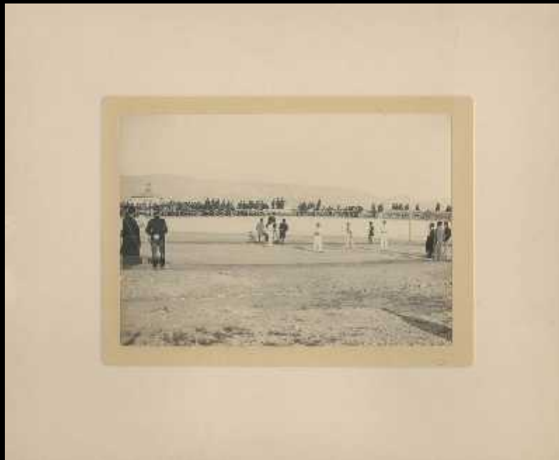
The athletes Friedrich Traun and John P. Boland during the tennis match