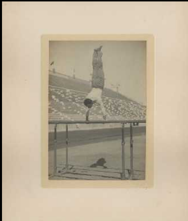
The German athlete Alfred Flatow (1 st place) performing exercises on the parallel bars