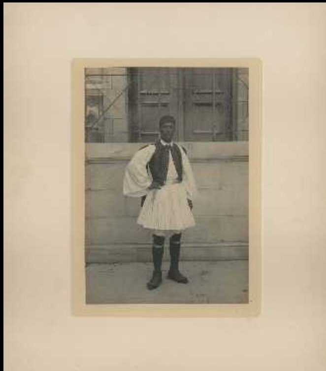
The Greek athlete, marathon-winner Spyros Louis in national costume