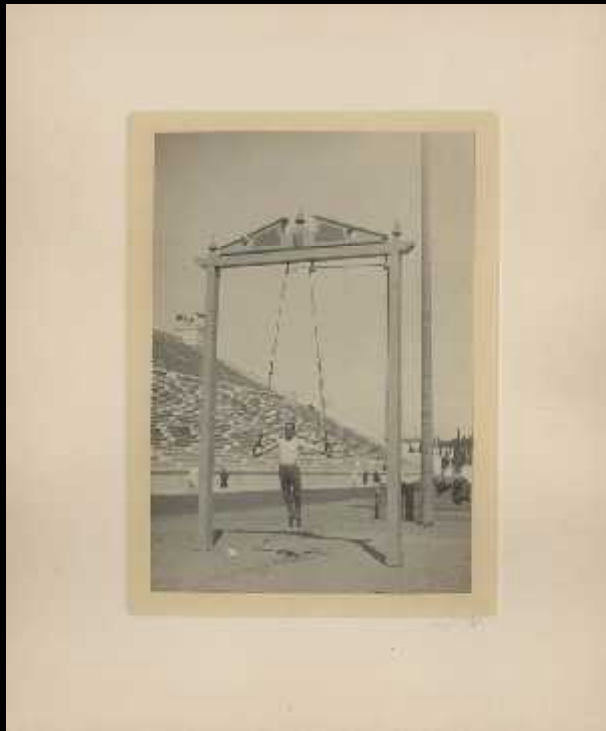
The German athlete Hermann Weingärtner performing exercises on the rings